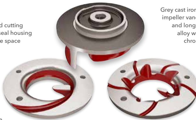
Hard-Iron impeller and insert ring including chopper version

Machined gap surfaces, created in high-precision manufacturing processes, provide tight tolerances and ensure high pumping performance.